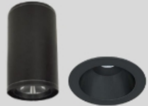
Ceiling Mounted Fixtures