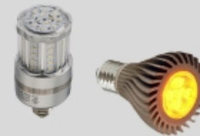
Red & Amber LEDs